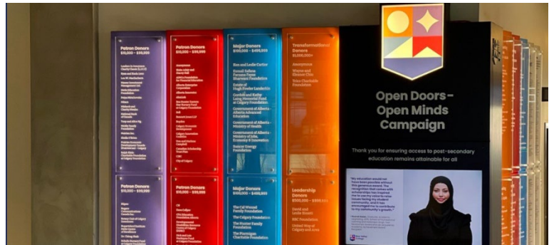
Bow Valley College donor wall, located across from the Esmail and Safana Bharwani Hall in North Campus

In our ongoing efforts to respond to the needs of our students and our province, we want to also recognize the building blocks that have been laid over the past year as we continue to build a legacy of educational excellence and student success. We are inspired by the spirit and leadership of our students, our staff and our city.